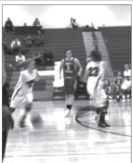
Lady Jackets in action against East Jessamine.