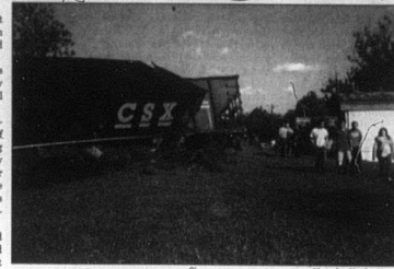
Derailed coal cars, each weighing over 100 tons, came dangerously close to several mobile homes at Blue Grass Trailer Park on Monday.

"I heard that noise and it just got louder and louder, and just kept coming and coming, so I grabbed my dog and out