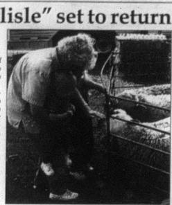
Children of all ages enjoy up-close-and-personal appearances with friendly farm animals at the Petting Zoo, which continues to be a perennial favorite.

A real crowd-pleaser is the Wiener Dog Race. The event isn't just a chance to find the fastest Dachshund, it's "dog-gone" cute.