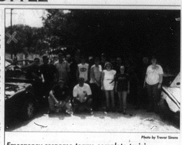
Emergency response teams complete training

Nicholas County County hospital then She received so many gifts and cards and had a beautiful cattle cake.