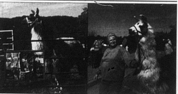
Llamas on Parade Sunday, several local farmers brought their favorite llamas to Blue Licks for the crowds to enjoy.