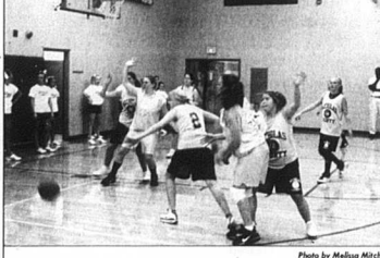
Lady Jackets Basketball Action: The Middle School girls basketball team in tough competition with Fleming County.