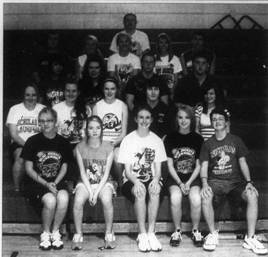
2009 Tennis Team