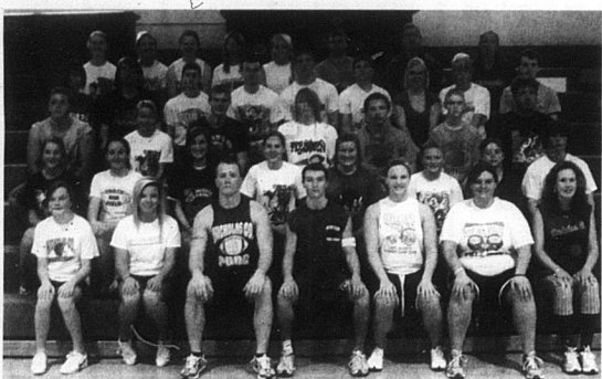
2009 Track Team