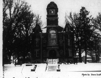
Snow Covered Courthouse. While most of Carlisle was sleeping, mother nature was hard at work blanketing the entire area with a thick layer of snow.