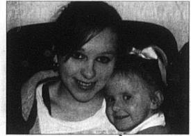
See LOSS Page 3