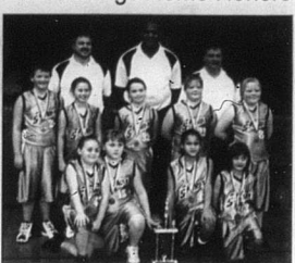
Nicholas County Blue Storm