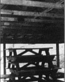
Photograph of vandals at Vanlandingham Park

circuit buck mounted on the side of the shelter house. The circuit buck carried high voltage live electrical current. Vandals also stacked picnic tables, destroyed a leaf trough and ripped metal trashcans from where they were mounted along the concrete floor of the shelter. Once ripped from the concrete floor, the encircling and athletic vandals placed one of the trashcans in the rafters of the shelter house. City sources say they believe the vandals consisted of at least three males, as the heavy picnic tables were precariously balanced, one atop the other and would