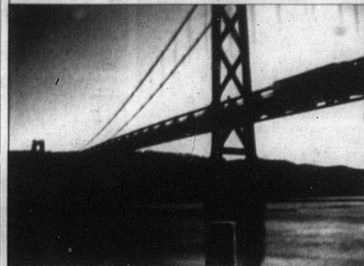
"Info Ohio" A view across the Ohio River from Limestone Landing in Mayville.