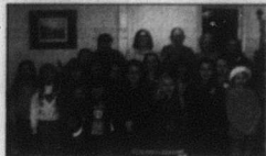
Caroling The Daisy Troop Group along with others went Christmas Caroling at Shepherds Place on Dec. 1.