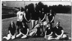
2009 Fleming County Ladies Golf

Nearly every student-athlete who competed last season for the Fleming County High School boys' golf program is back for the 2009 campaign. The Fleming County High School boys' golf program returns all but one player from last season's squad.