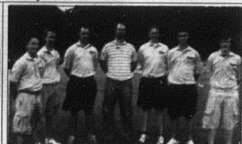
2009 Fleming County Mens Golf