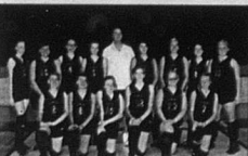
2009 Fleming County Volleyball Team