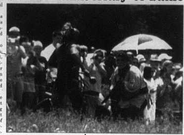
A Native American warrior and Kentucky militia soldier face off near the crowd during the battle re-enactment held over the weekend of Blue Licks Battlefield State Resort Park.