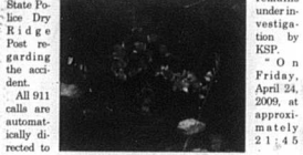
Flowers mark the spot where four lives were lost during a tragic accident April 24, along Lake Road, just north of Carlisle.