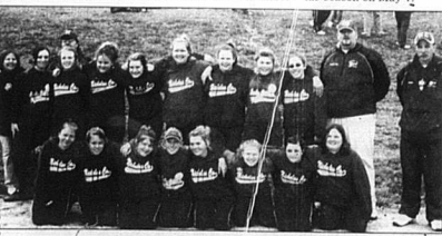
The Nicholas Co. Middle School girls' softball team won 2nd place in the Bracken Co. Tournament.