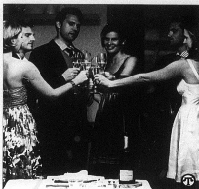
Chilling bottles of a classic aperitif in vintage silver buckets will lend old-world elegance to any table.