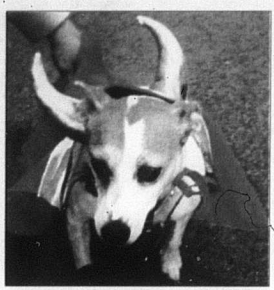
This little Jack Russell named Jelly Bean is ready for Halloween.

young child's mind. Halloween stickers and temporary tattoos are two other options.