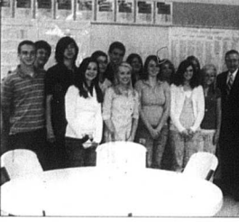
Congressman Geoff Davis is shown surrounded by members of the NCHS student council, who engaged in a casual but candid conversation with the Congressman.

"This legislation does a major disservice to American citizens and to the American free market system. I am very disappointed that the other viable options proposed by economists and my colleagues were not given more thoughtful consid-