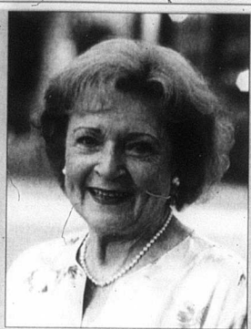
Betty White urges Seniors to take advantage of free eye exams.

"I'm happy that I can do my part in helping older Americans get the eye care they need," adds White. "I only hope that seniors across the country will pick up the phone and take advantage of EyeCare America's free eye exams. It's a call that can save their sight."