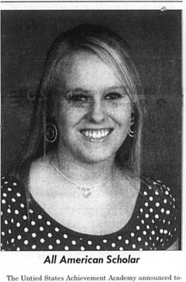
All American Scholar