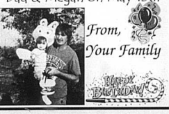
From, Your Family