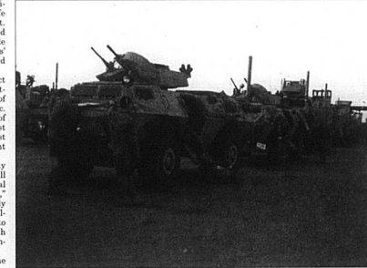
The soldiers of Battery B prepare for one of their many convoy security missions inside Iraq.