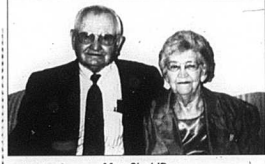
Mug Shot ID