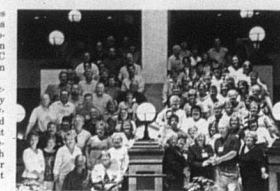
Participants at the 2008 Circuit Court Clerks Summer College.

The college also offered sessions on strategic planning, how to troubleshoot problems with bookkeeping and personnel, and how to prepare court records for