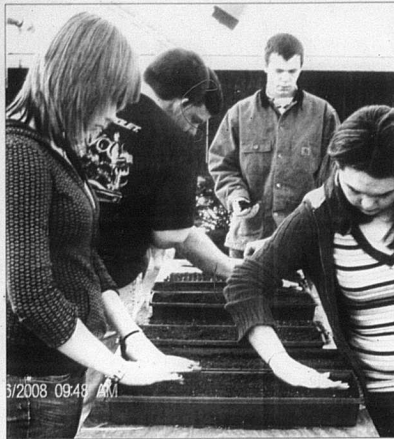
5/2008 09:48 AM