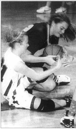
Photo by Christian Dünn (31) battles for a loose ball in NCHS's 50-25 loss to Lexington Sayre on Parents' night.

The Lady Jackets played close for a half with Lexington Sayre on parents' night last Friday, but the visitors pulled away to claim a 50-25 win.