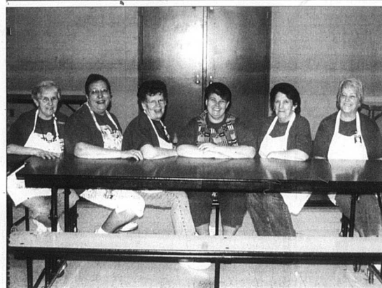
NCEMS Cafeteria Staff