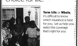
Shelter Life Insurance Company Columbia, MO www.shelterinsurance.com