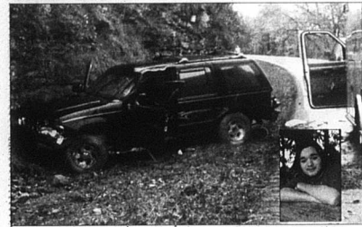
Accident