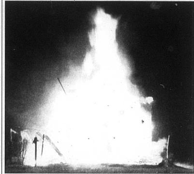
A Stony Creek home was engulfed in flames as firefighters arrived on Nov. 23.