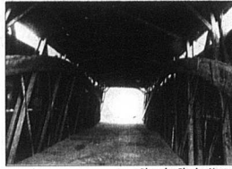
This is an inside view of the Robertson County covered bridge at Johnson Creek.