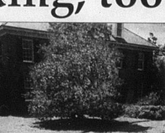
Though often overlooked, repairing a driveway is an important home improvement.

rent out power washers. Buying one yourself actually comes with an applicator you won't use if you don't use it nearly enough to make it worth the cost. Once you've thoroughly swept or washed your driveway, apply asphalt sealant. This will soften its surface, making it easier for water to seep through. Fill the cracks: Once the driveway's been cleaned, it's time to fill the cracks to reseal. It's especially important if the weather forecast isn't calling for rain. Ineffective, sealer needs to dry thoroughly. Different sealers require different tools, so whichever type you choose, make sure you have the right tool to apply the sealer. Once you've finished and the sealer has dried, your driveway will be as good as new. And more importantly, you'll have significantly improved your property at very little cost.