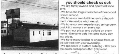
Come see why we sell more Fleetwood Homes than any other dealership in the area! Save big on our remaining inventory of 2006 models, or take advantage of our everyday low prices and custom order a Fleetwood home with the colors and options YOU want!

888-552-2334 3 Miles North of Flemingsburg on Highway 11 www.fleetwoodkentucky.com A&L HOMES, THE OLDEST AND LARGEST FLEETWOOD HOMES DEALERSHIP IN THE AREA, IS HAVING A LOT MODEL SALE! SAVE $5 THOUSANDS $5 ON OUR REMAINING 2006 MODEL HOMES!