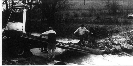
Members of the Nicholas County Fire Department helped rescue a mother, her two children and the family's pet when high waters threatened her home on Upper Sharpsburg Road. No one was injured.