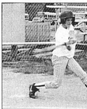
Next week, the Lady Jackets have a busy schedule, playing six games in six days. See bracket on page 2.

Nicholas gears up for the 37th District Tournament later this month. The club has been off almost a week (rain) and with a muddy field they haven't had much practice time. The Lady Jackets are scheduled to play four games (in as many days) next Monday through Thursday. And a doubleheader is on the agenda for next Saturday, May 18.