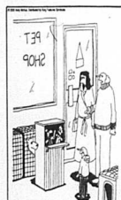
This breed of dog is particularly good with children.

I hope the House of Representatives has the good sense to about this bill down. My interest lies in the fairness of the issue—either make BOTH sides available, or none at all. There is no justice in giving one side all the power, and the other no voice at all.