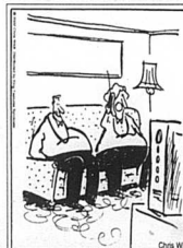
"The weight gain began when we locked out all the sex and violence on TV... That left the cooking shows."