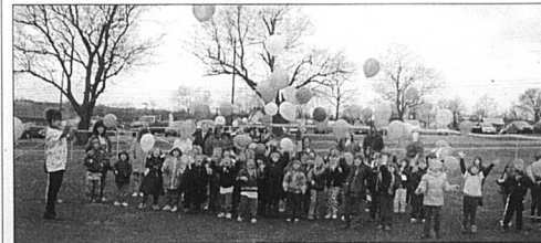
At the stroke of 1:00 p.m. on the 100th day, the first graders released their balloons into the cold, windy sky Friday afternoon.