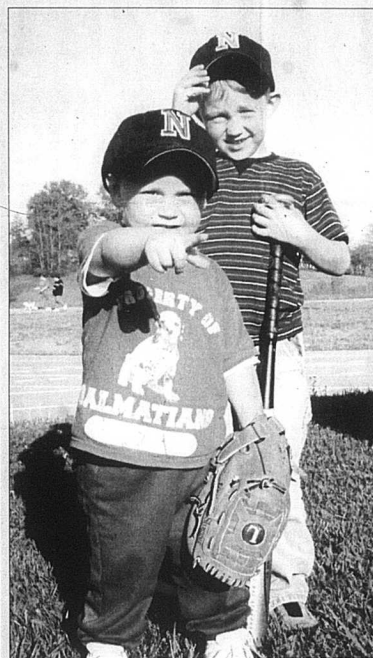
Denver Brown photo