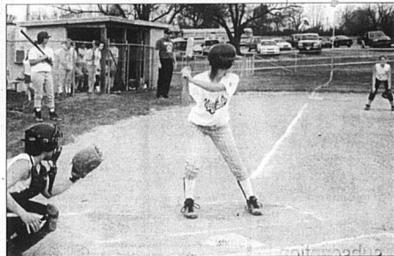
The Lady Jackets softball team used aggressive base-running and really rattled the bats in an eight-inning, 11-10, win over Bourbon County.

'In the dugout' The Nicholas County baseball players watch their opponent warm up last week in Carlisle. The Bat Jackets have won three-of-four and are 6-3 on the season.