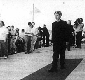
Tenth Frame Cinema rolled out the red carpet, literally, for the premiere of Sumpter's feature film debut, Frailty.