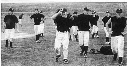
The Nicholas County Bat Jackets comes off the field after a win over Fleming County.