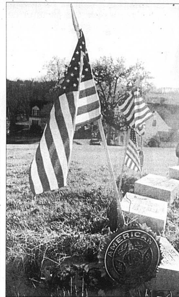
Each year, the local American Legion decorates veterans' graves in the Carlisle Cemetery in celebration of Veterans' Day. After the tragedy of September 11, more emphasis is being placed on the nationwide day of honoring the men and women who have served.