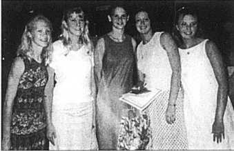
These young women, dressed in their best, were just some of the eighth graders who graduated Nicholas County Elementary School.