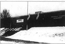
Nicholas County schools are back in session after Christmas break. Students started on schedule Tuesday morning.