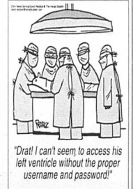
"D'rat! I can't seem to access his left ventricle without the proper username and password!"