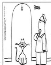
"Hey, I like you a lot, Snookums, but not enough to kiss you under the catnip."