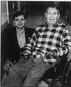
Rep. Fletcher recently visited with patients at the Leestown VA Hospital to learn about VA funding.

Providing quality health care and benefits to Veterans and investing in the United Armed Forces are two priorities for Congressman Fletcher in the 107 th Congress. He will continue to fight to keep America's promise to its service men and women.