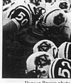
Nicholas County linemen bust helmets.