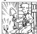
Spray gardening equipment such as shovels, pruning shears and lawn mowers before winter.

Additionally, WD-40 sprayed in locks can help keep them from freezing up in the cold months ahead.