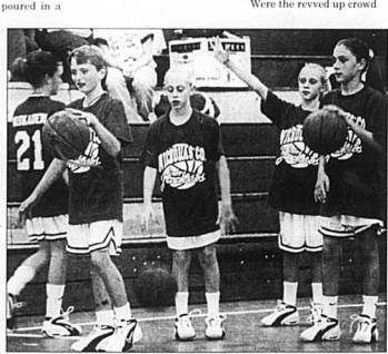
Denver Brown photos