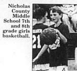
Nicholas County Middle School 7th and 8th grade girls basketball.