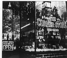
"The Corner Store" is appropriately located at the corner of Main Street and Broadway. It also is located directly across from the Nicholas County Courthouse.

The Corner Store invites you to stop in and take a look and maybe do some Christmas shopping.