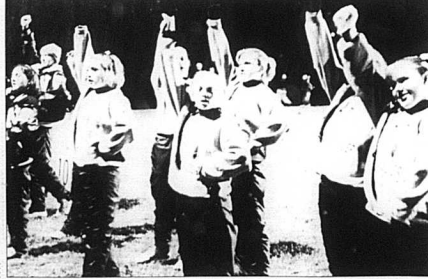
Nicholas County High School cheerleaders excite the crowd.

The Jackets announced All-District honors last night and The Carlisle Mercury will run pictures of the selection in next week's sports section.