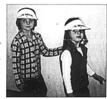
Head Start students participate in the mini walk-athon.